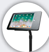
Vertical or Horizontal Viewing